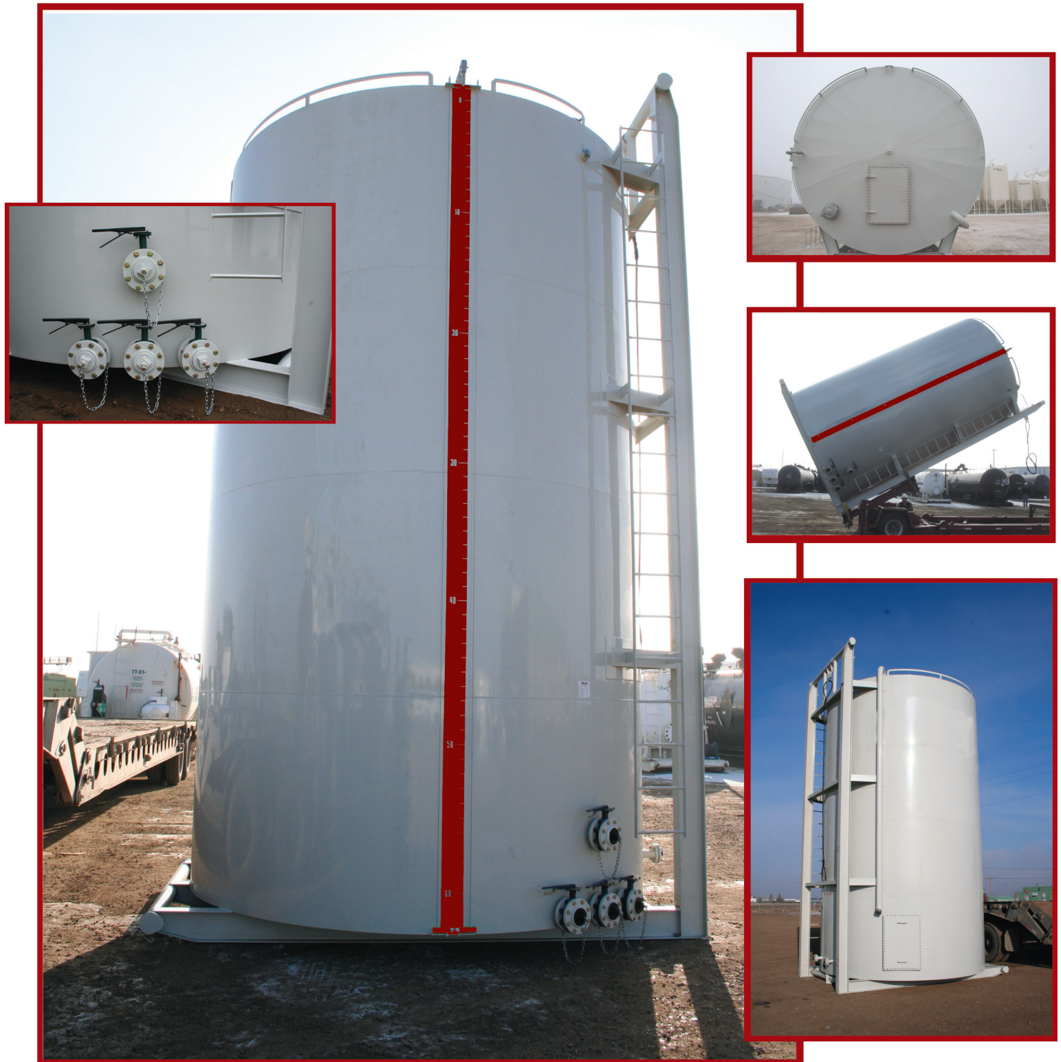
400 Barrel Portable Tanks